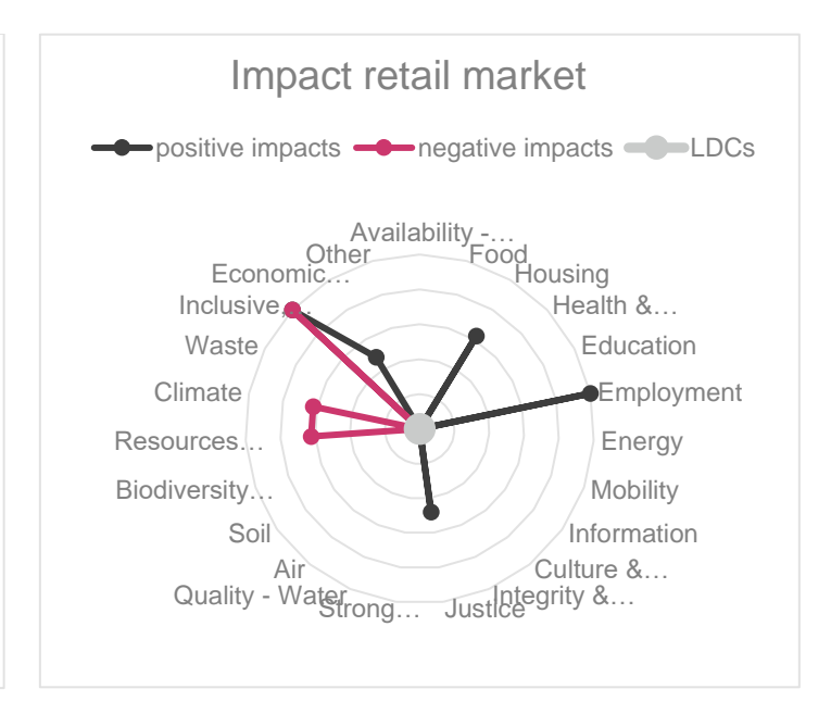
LDC: Least Developed Countries